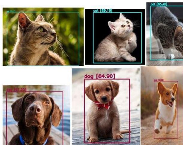
Fig 2: Cat and dog detection

The created framework can effectively perceive different everyday use objects; in the (a) image, it can recognize a seat with 88% precision and an individual with 87% exactness inside a solitary edge and in the picture (b) can distinguish canines and felines as items with a standard of 84% accuracy. It can likewise determine a few different things like a mobile phone, PC peripherals, etc. The prepared model tends to be specially designed for other items.